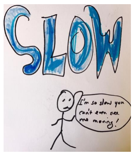
I work very very slow.

He identified as straight but we eventually slept together and then I let my heart get broken.