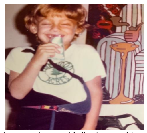
I try to keep my six year old alive in everything I make. What joy! But I don't always succeed.

it feels like old hardwood under bare feet – strong and sturdy, storied It tastes like salt. And sugar. And lemon<sup>1</sup>.